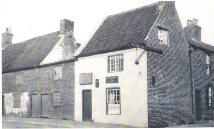
The Blue Ball Rudston.

Above is the Blue Ball Pub which burned down on 3rd June 1938. It was situated in Middle Street on the site which is now fenced off with metal posts and a chain, opposite the old pump. The door on the right were the living quarters to the pub.